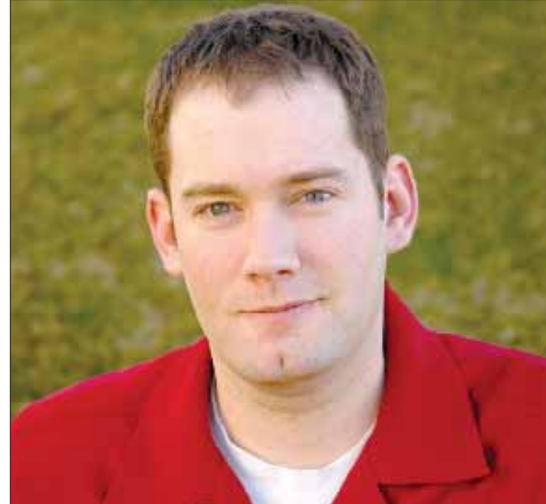
Brandon Mull spent his childhood in Clayton and sees the town as the perfect setting for "Candy Shop War."

"Candy Shop War" is available at Clayton Books in the Clayton Station.