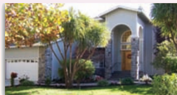
Walnut Creek $1,225,000

Falcon Ridge – 4BD/3BA w/open floorplan has approx. 3,079 s.f., vaulted ceilings & full b/b downstairs along w/ elegant formal living & dining rooms. Gourmet kitchen w/double oven, pantry, island, breakfast bar & dining area. Pool-sized .5 acre lot w/RV/Boat pkg. & plush lawns.