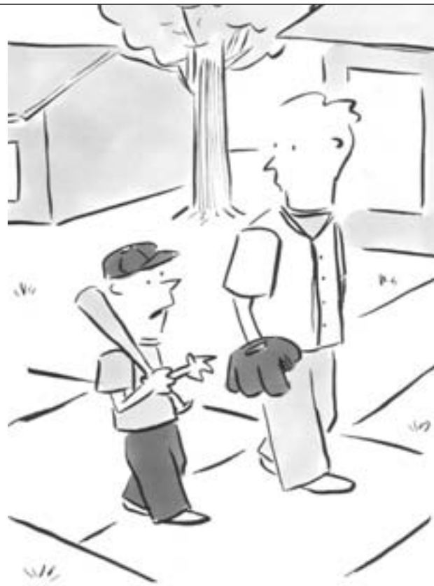
"Y'know, Dad, if you want to keep living vicariously through me, I'm gonna have to start charging you."