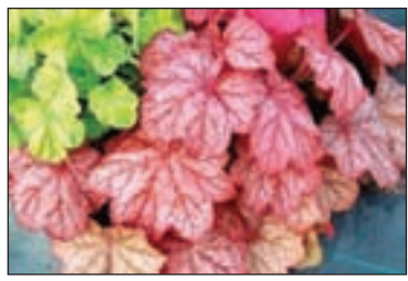
HEUCHERA GEORGIA PEACH

Heuchera Georgia Peach is another new introduction. It does best in mostly sunny spots, with some shade during the afternoon. Those of you who know of the fancy leafed coral bells will be excited by the newest selection. Georgia Peach has huge, peachy colored leaves, with a showy white overlay and large lush growth, almost hosta-like in size, but as evergreen as a shrub. Plant this heuchera in