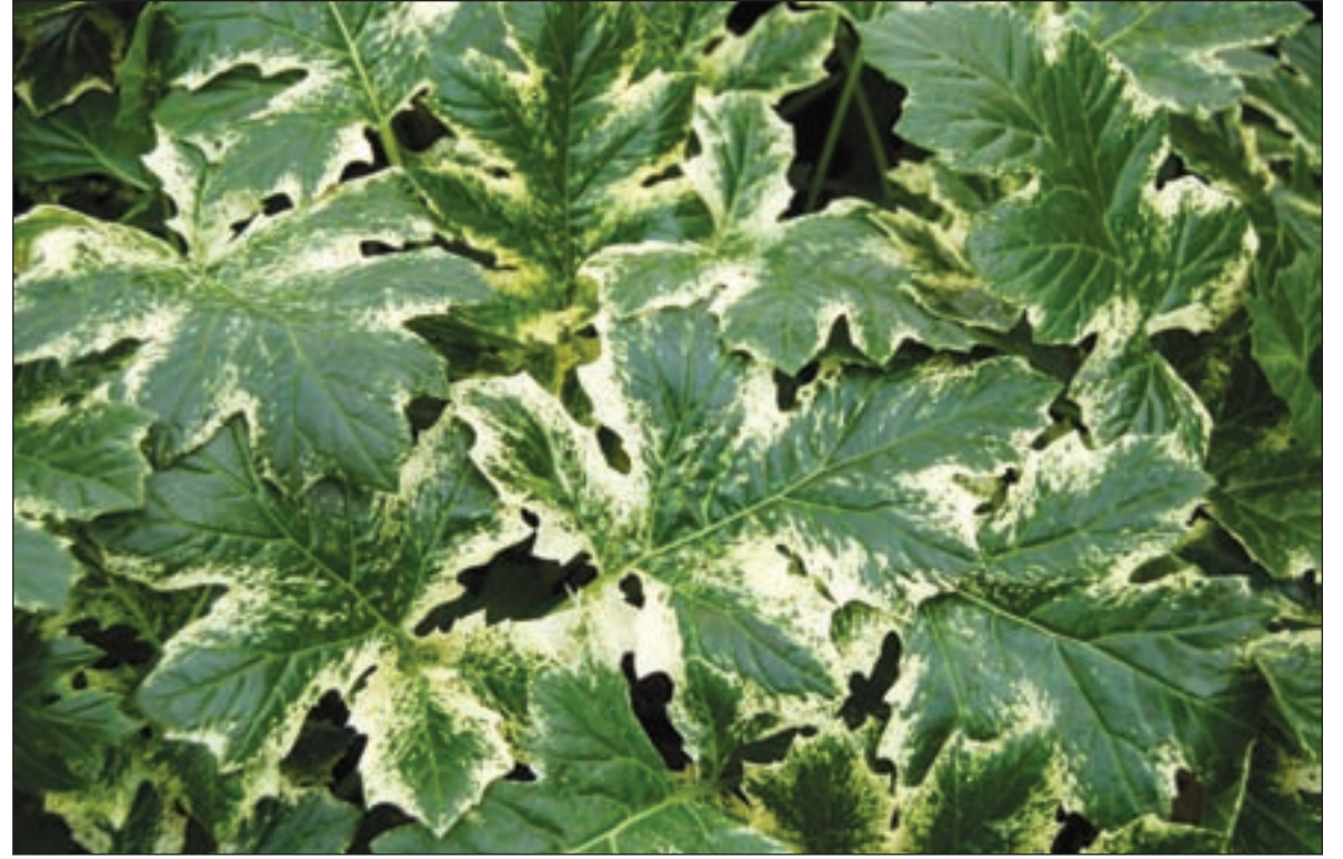
ACANTHUS TASMANIAN ANGEL

Every year we have a new Echinacea to enjoy. This year, there is Purity . This robust white cone flower has the potential to be a star in any full sun, cut flower garden. Pristine white blooms reach 4-5 inches across on sturdy stems; expect over 25 large blossoms after a year of establishment. One big mistake with the cone flowers is our desire to over-water these perennials. Once established, coneflower will be fine with water every second to third day during the summer months. Too